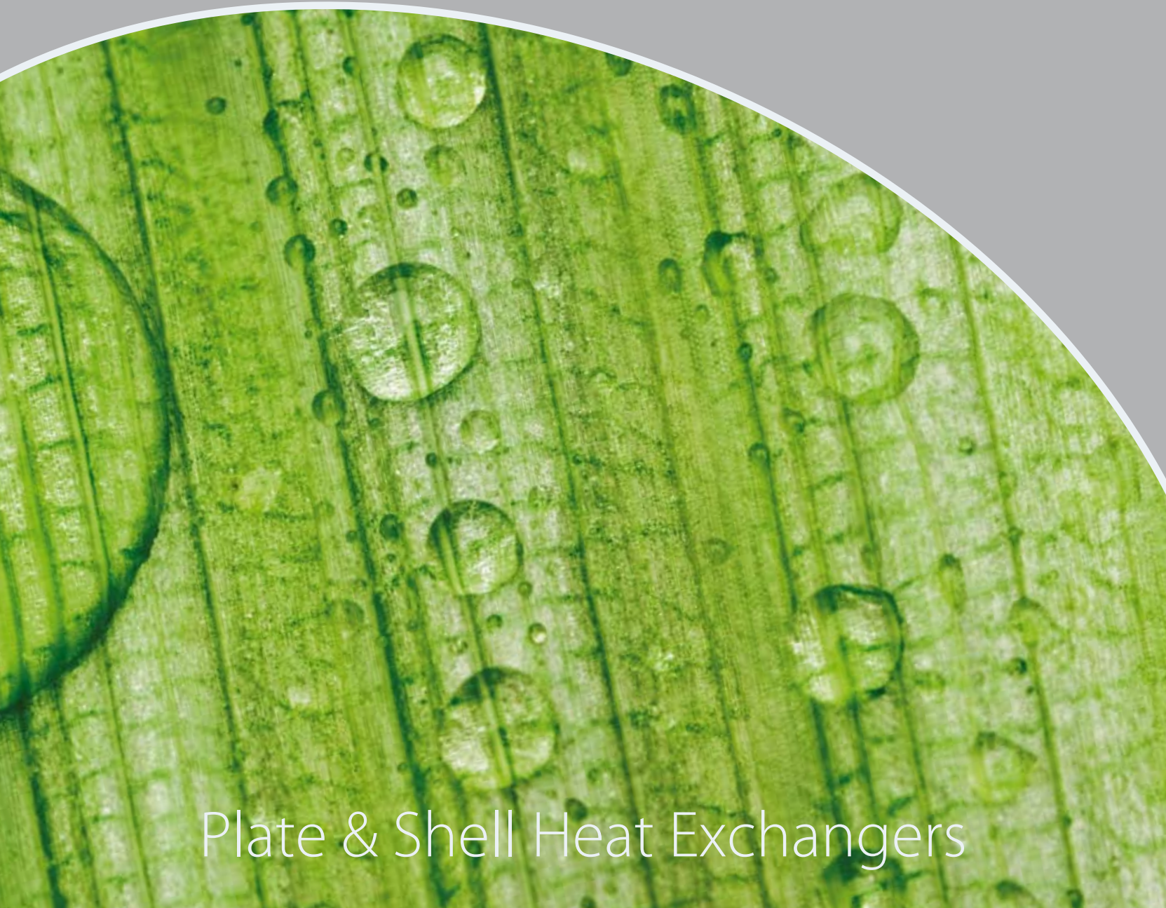
Plate & Shell Heat Exchangers