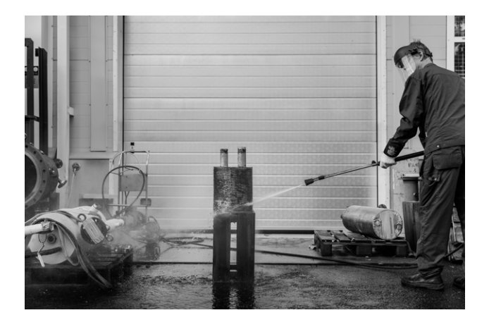
High-pressure water cleaning of a plate pack at Vahterus manufacturing facilities in Kalanti, Finland.

The rental period can range from a week to several months. There are 23 models available. Details are available from Vahterus sales on request. Rental services are currently available only inside the EU.