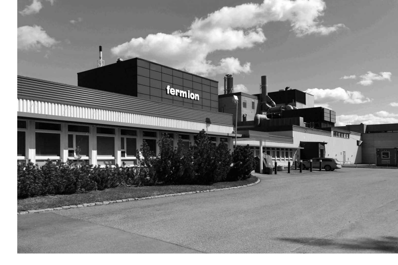
Located in Oulu, Northern Finland, Fermion's chemical plant manufactures pharmaceutical ingredients used in medicine for cardiovascular diseases, cancer and psychological disorders.

Vahterus's Plate & Shell heat exchanger met all the operational expectations and endured the conditions that other technologies could not. Following positive experiences over the years, Fermion has installed more Vahterus products to replace broken heat exchangers in their processes. The latest collective project was the expansion of the Oulu plant in spring, when Fermion equipped its new reactors with Vahterus products. 'At the moment, we're engaged in a renovation project where the heat exchangers of three pieces of manufacturing equipment are being renewed, six new heat exchangers in total', says Hassinen.